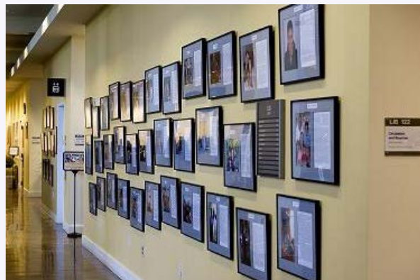
"Missing Story of Ourselves" Exhibit