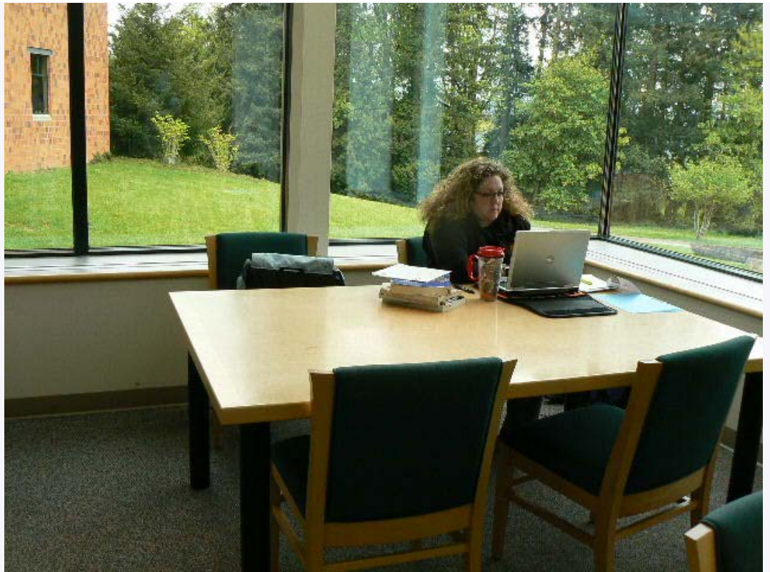
Student enjoying the view while she studies

classes in partnership with teaching faculty. This last year librarians have added teaching General Education classes to their instruction program as the campus has expanded to include first and second year students.