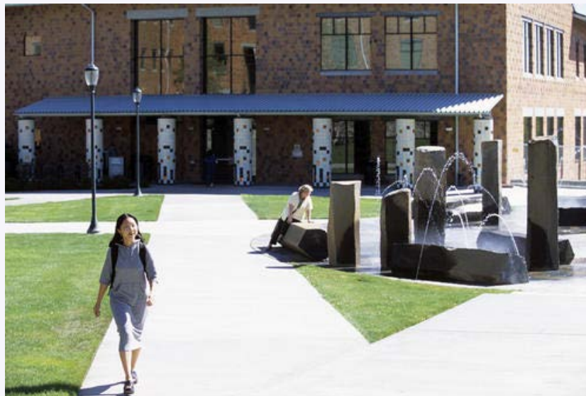
WSU Vancouver Library Building and the Firstenburg Family Fountain