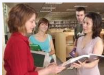
WSU Vancouver is known for service to library patrons

Washington State University began offering courses in Southwest Washington in 1983 as part of the Southwest Washington Joint Center for Education. In 1989, the University formally established Washington State University Vancouver as a branch campus of the state's land-grant institution. The university was then housed in Bauer Hall on the Clark Community College Campus in downtown Vancouver, Washington. The library consisted of one room in Bauer Hall at that time. By necessity the collection was small but drew upon the resources of WSU in Pullman, making WSU Vancouver library a "just in time" provider of information placing it on the cutting edge of what has become a common practice in library service.